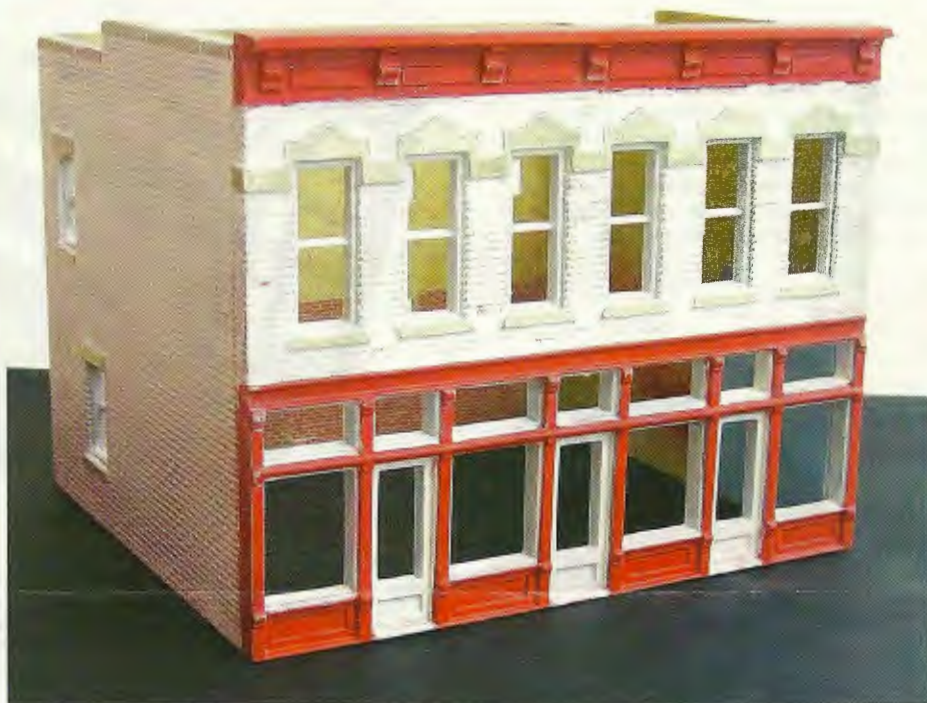
Nearly finished, here's Walthers Cornerstone series HO-scale Jim's Red Owl awaiting the install of its interior and layout placement. This collection of buildings from Walthers offers the hobbyists many choices in recreating classic North American business districts found in nearly every size town.

roughed up or "well used" looks to the bricks, window, and door frames.